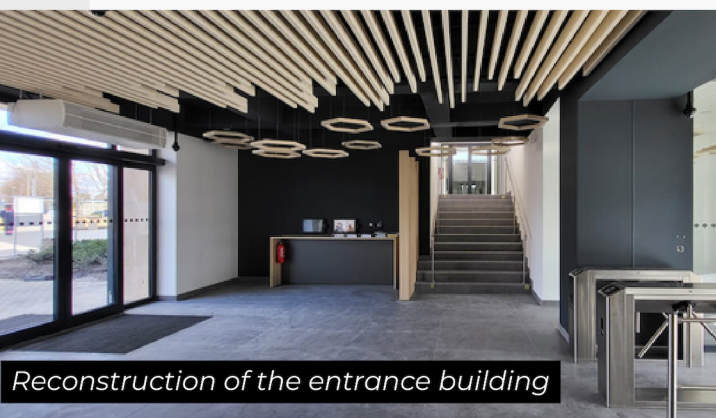
Reconstruction of the entrance building