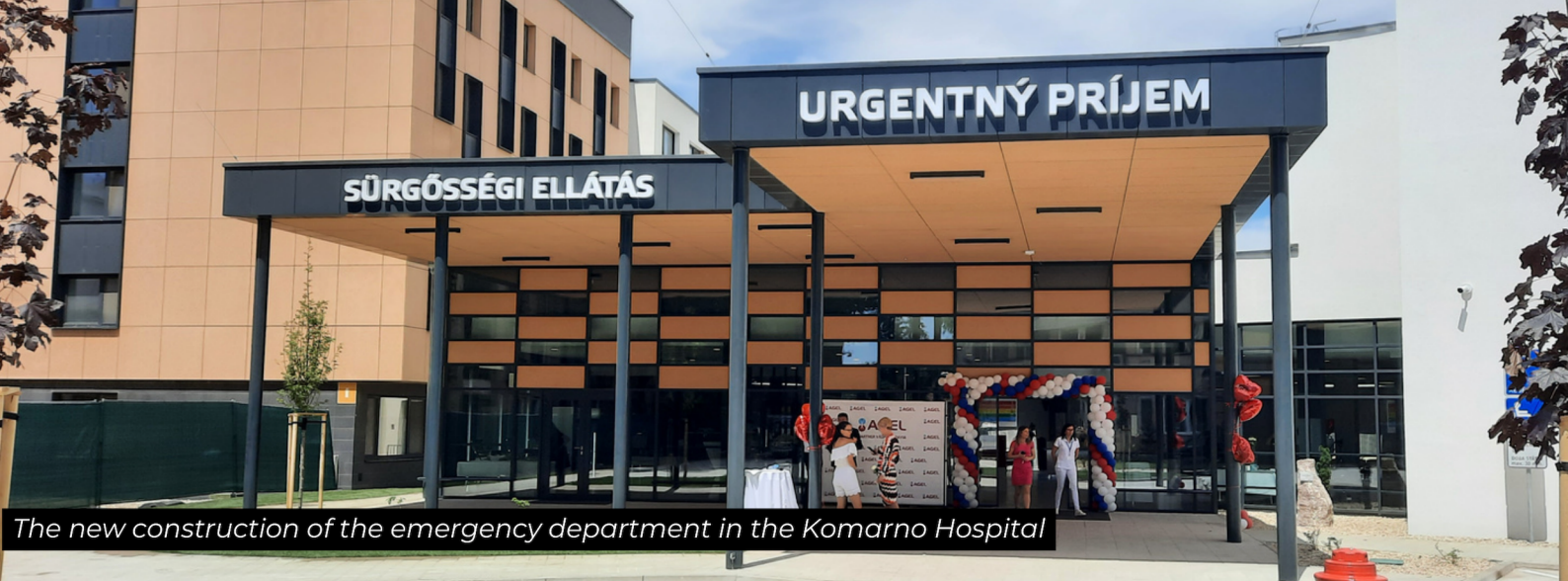
The new construction of the emergency department in the Komarno Hospital