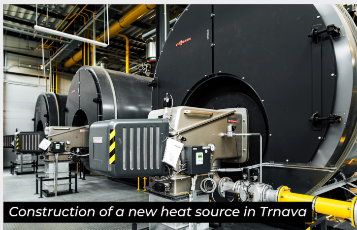
Construction of a new heat source in Trnava

During construction, we place emphasis on efficiency and quality of work, which also contributes to the use of materials from renowned manufacturers. All activities are ensured and carried out under the supervision of qualified construction managers and construction supervisors. Realization of constructions, or renovations of buildings meet the requirements of health and safety, fire protection and are checked by the safety coordinator according to valid decrees.