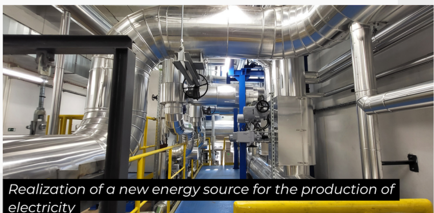
Realization of a new energy source for the production of electricity