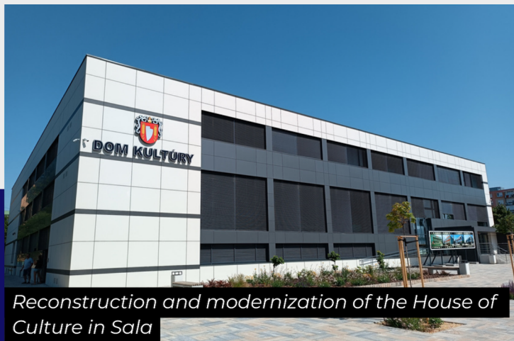
Reconstruction and modernization of the House of Culture in Sala